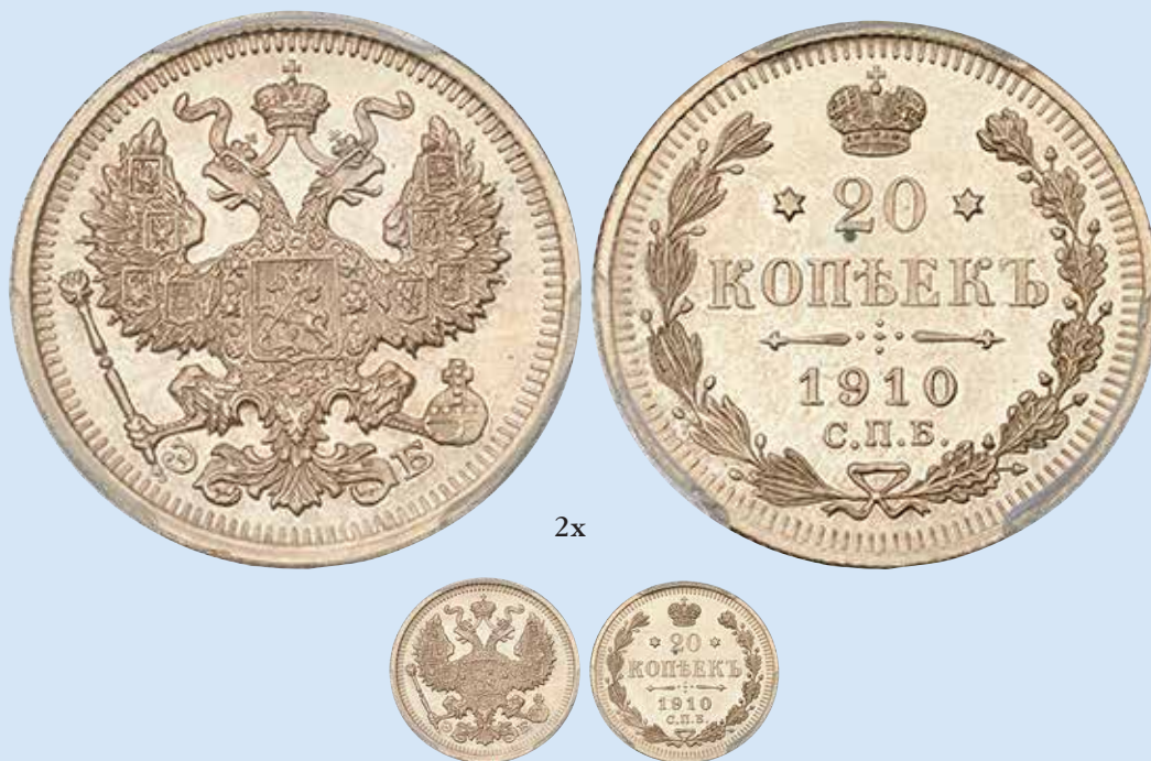
2195 20 Kopecks 1910 СПБ-ЭБ. Bit 110, Sev 4144. Authenticated and graded by PCGS PF 63. Choice brilliant PROOF