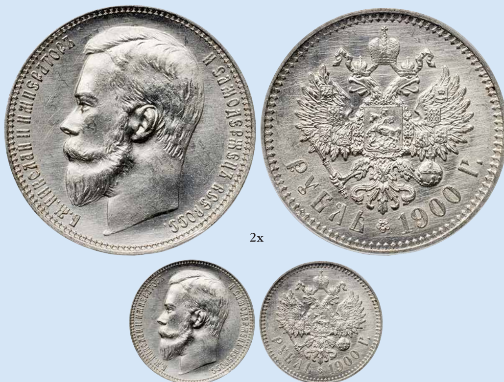
2184 Rouble 1900 \Phi 3 . Bit 51, Sev 4080 (S). Authenticated and graded by PCGS MS 64 (Cert. #925899.64/21756324). A pleasing satiny white example. Very Choice Brilliant Uncirculated.