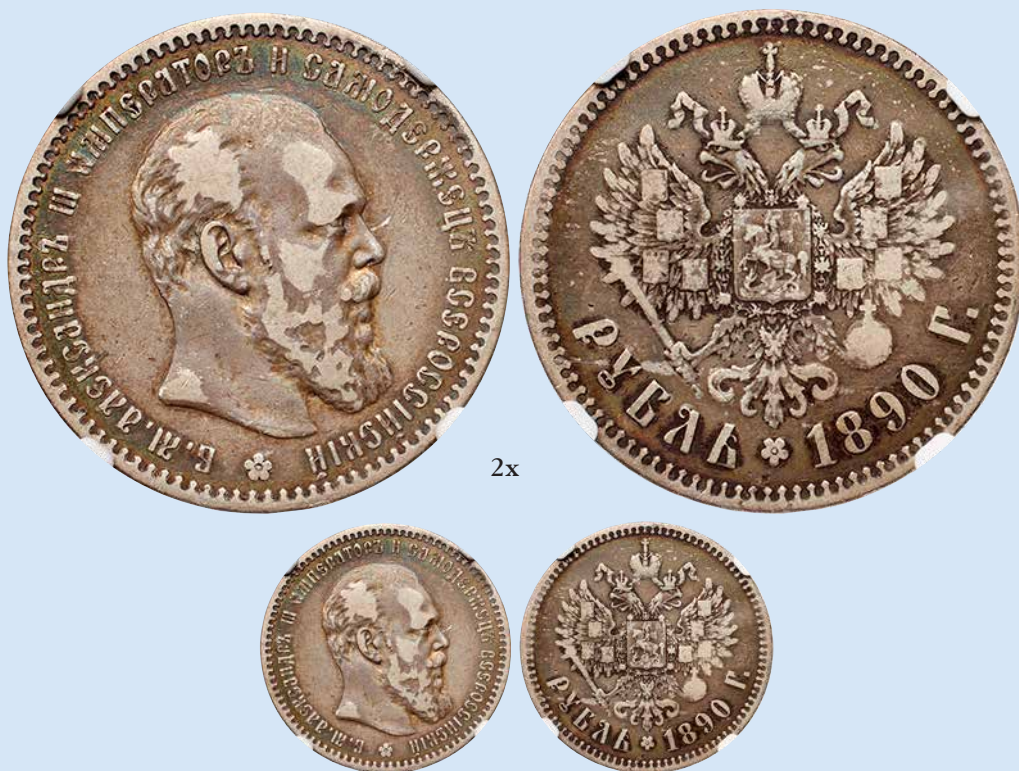
2153 Rouble 1890 АГ. Bit 73 (R), Sev 3998 (S). Rare date with mintage of only 90,300 pcs. Authenticated and graded by NGC VF 30 (Cert. #4501417-002).