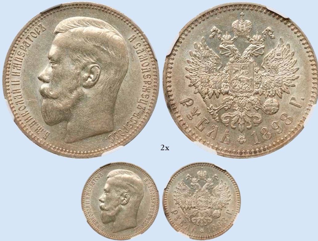
2183 Rouble 1898 * (Paris). Bit 195, Sev 4051. Authenticated and graded by NGC AU 58 (Cert. # 6522771-013). Satiny white. Choice almost uncirculated.