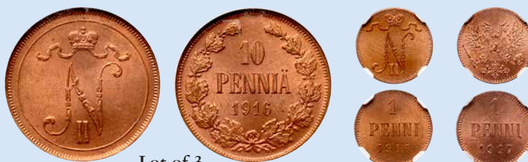
Lot of 3