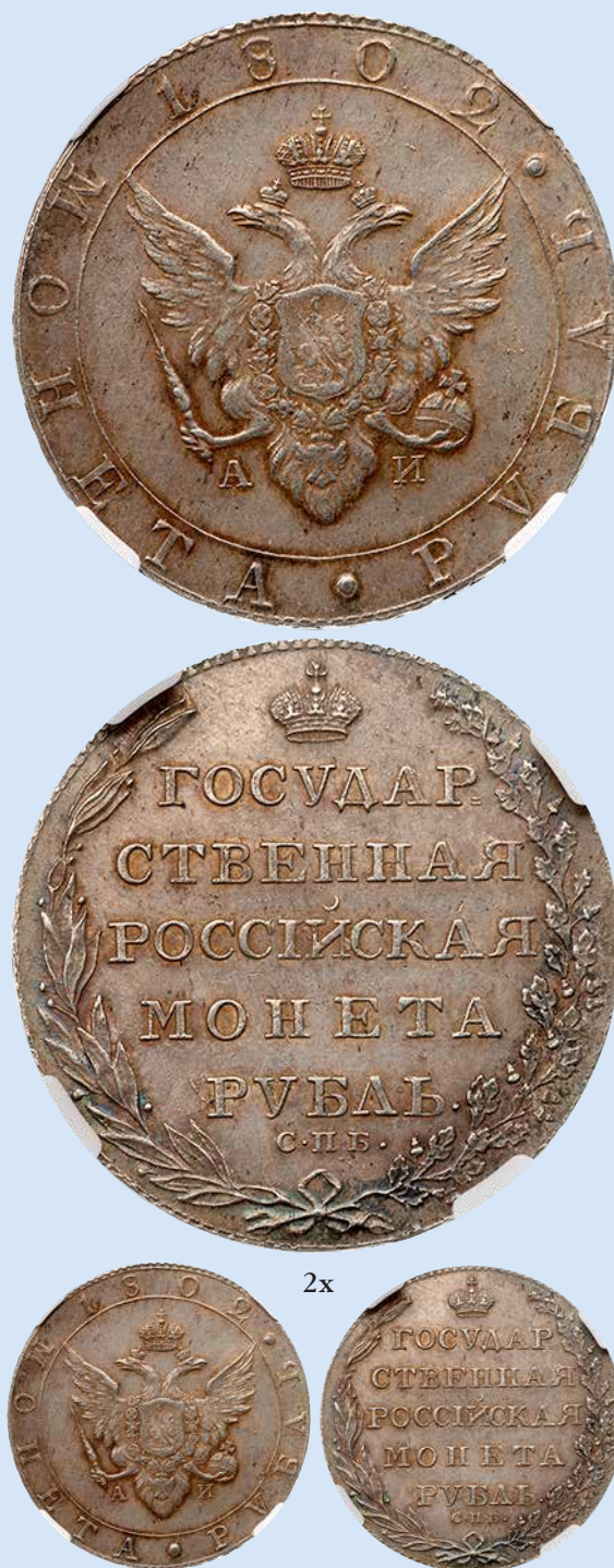
2076 Rouble 1802 СПБ-АИ. Bit 28. Authenticated and graded by NGC AU 58 (Cert. #6678766-006). Light gray tone.