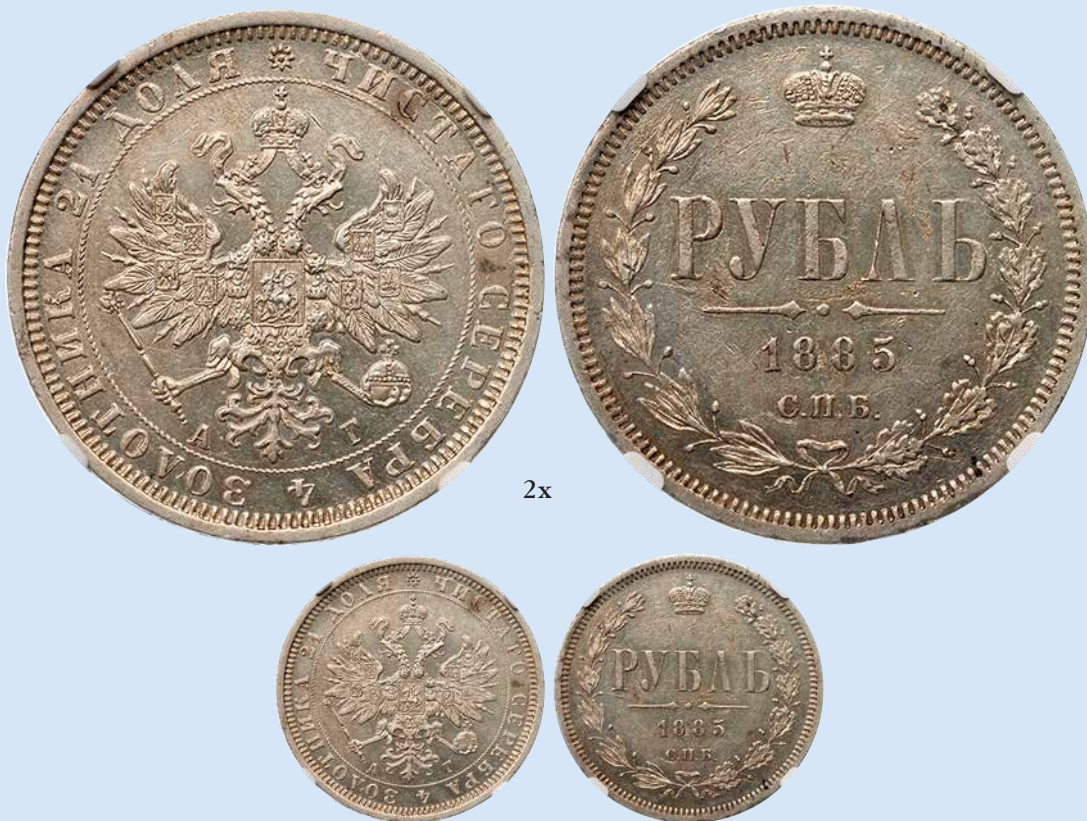
2152 Rouble 1885 СПБ-АГ. Bit 46. Sev 3955 (S). Mintage of 499,511 pcs. Authenticated and graded by NGC AU 58 (Cert. #6678766-013).