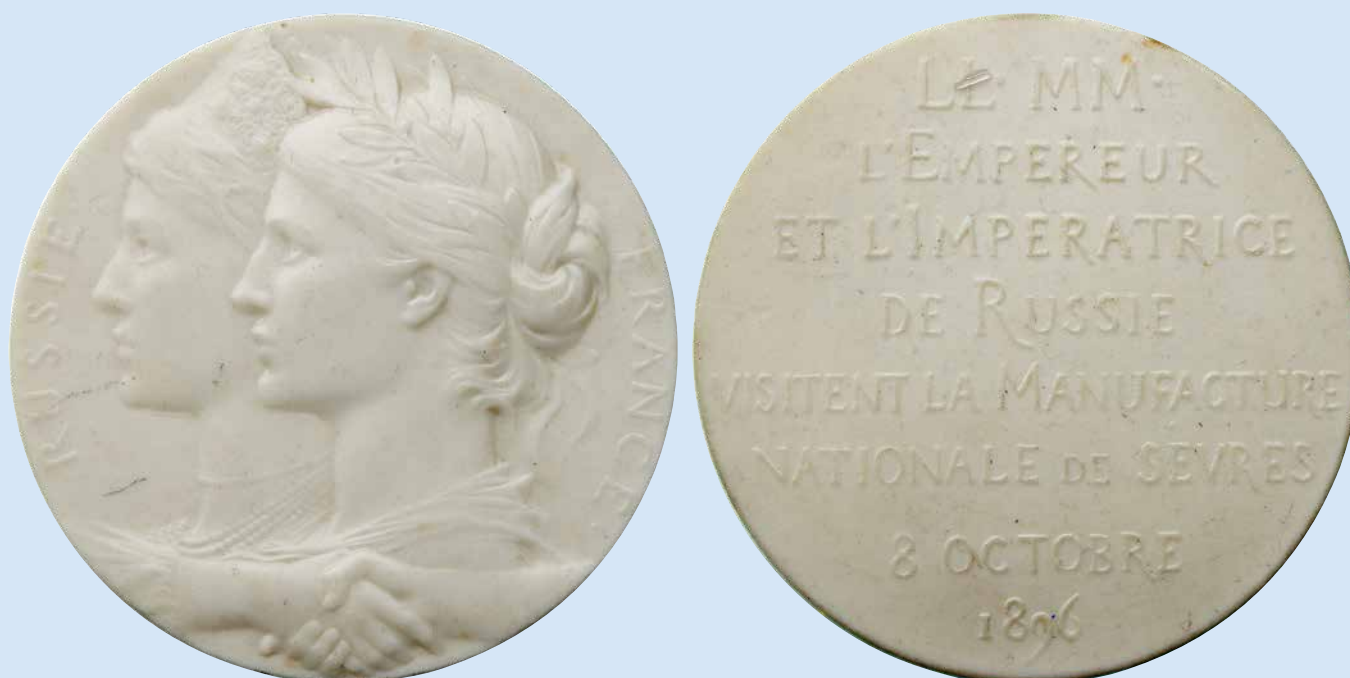
2205 On the Visit of Nicholas II and Alexandra Feodorovna to the Sèvres Porcelain Factory, 1896. Medal. Porcelain. 88.5 mm. By J. Chaplain. Conjoined busts of Russia and France left, clasped hands below / Eight-line legend.