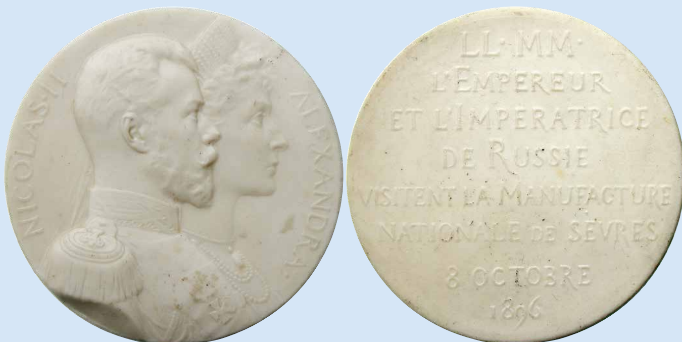
2204 On the Visit of Nicholas II and Alexandra Feodorovna to the Sèvres Porcelain Factory, 1896. Medal. Porcelain. 89 mm. By J. Chaplain. Conjoined busts of Nicholas and Alexandria right / Eight-line legend.