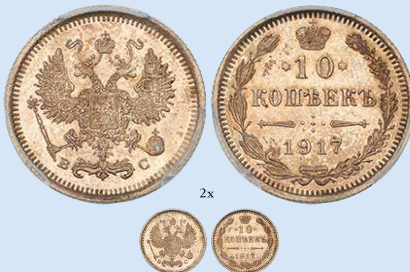
2196 10 Kopecks 1917 BC. Bit 170 (R1), Sev 200 (RR), Uzd 2225. Rare. Authenticated and graded by PCGS PR 66. Marvelous strike on mirror-like fields. Superb Gem PROOF.

Ex 'The New York Sale L', New York, January 16, 2020, lot 2249. Comes with tag.