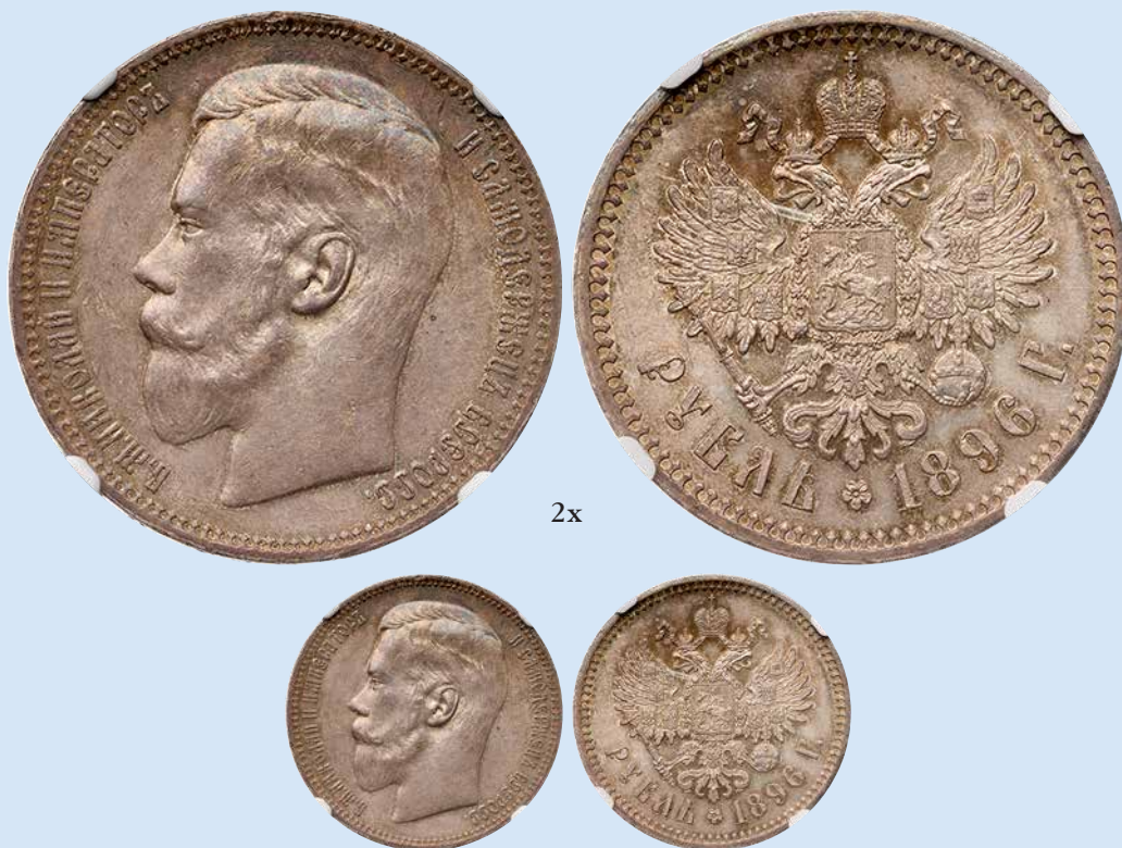
2180 Rouble 1896*. (Paris). Bit 193, Sev 4034. Authenticated and graded by NGC MS 61 (Cert. #6678768-005). Soft pearly gray tone.