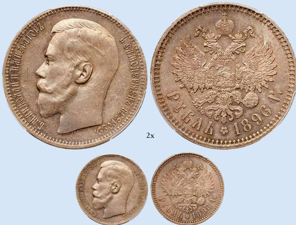
2179 Rouble 1896*. Paris mint. Bit 183 Authenticated and graded by PCGS MS 61 (Cert. #925892.61) – mislabeled as AG on holder. Pearly lavender-gray.